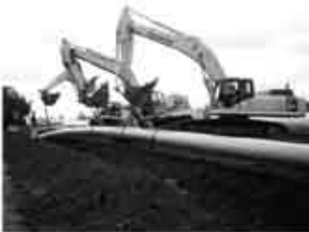
Natural Gas Mainline Aurora, OR

Contact us for a list of contractors who can provide you with competitive bids and the highest quality labor.