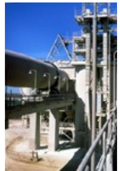
Portland Cement Association

Registration for the 2010 Annual PEO Conference is open.